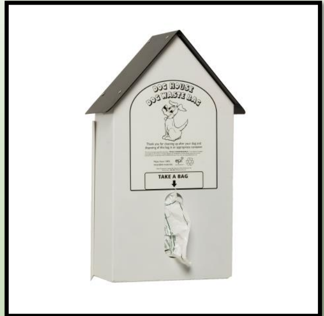
Large Dog Waste Bag Dispenser Front Pull Style - holds bundles of 250 Bags Stapled Pack