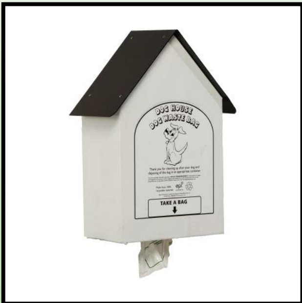
Standard Dog Waste Bag Dispenser Bottom Pull Style - Holds 1 case of 1000 bags